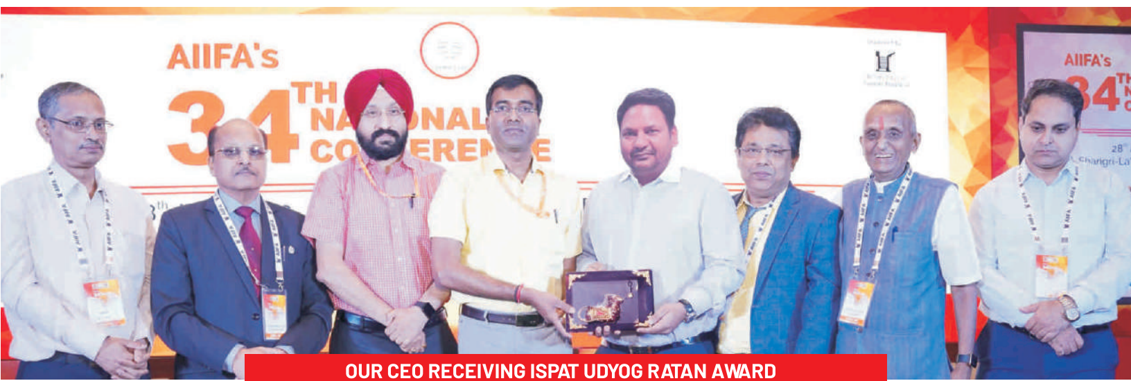
OUR CEO RECEIVING ISPAT UDYOG RATAN AWARD